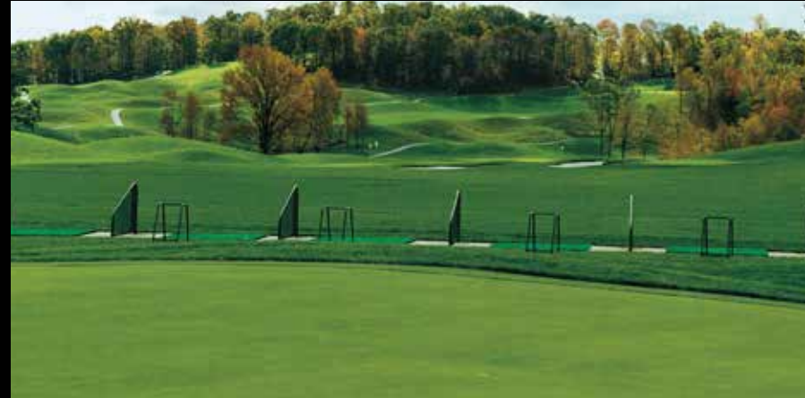
HIMALAYAN RANGE PRACTICE ACADEMY