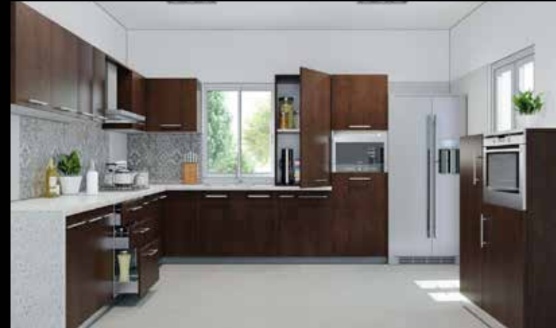
DESIGNER KITCHEN WITH BUILT IN APPLIANCES