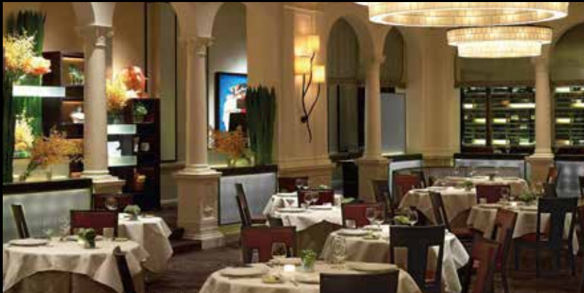
FINE DINING RESTAURANT