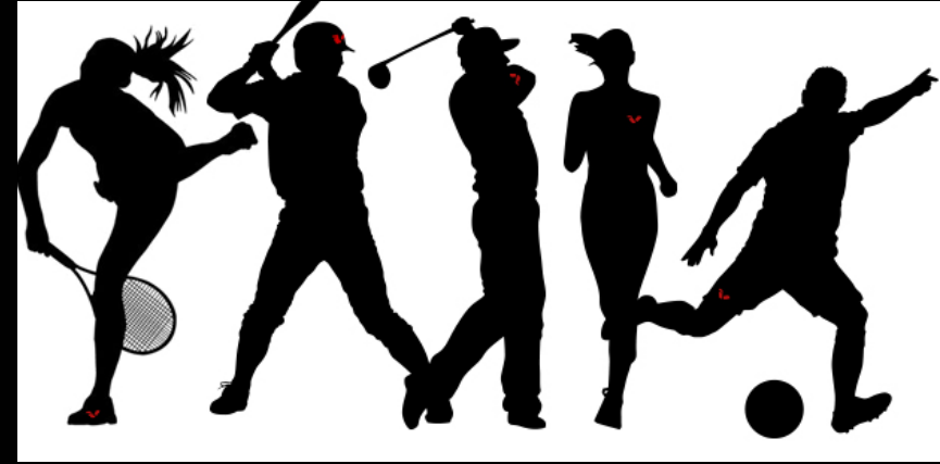
STATE-OF-THE-ART SPORTS ARENA