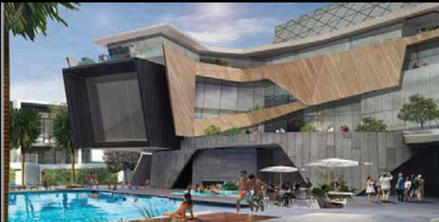
EXPANSIVE GOLF CLUB