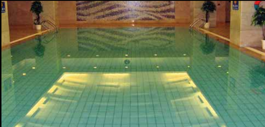
INDOOR HEATED POOL