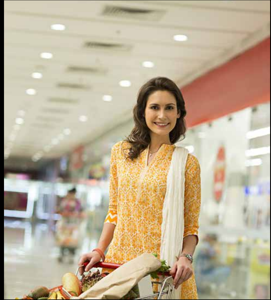
HIGH STREET RETAIL