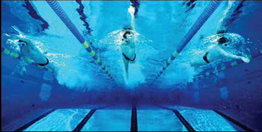
OLYMPIC SIZE SWIMMING POOL