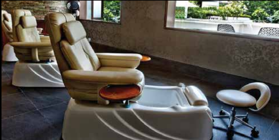
SPA & SALON BY WARREN TRICOMI