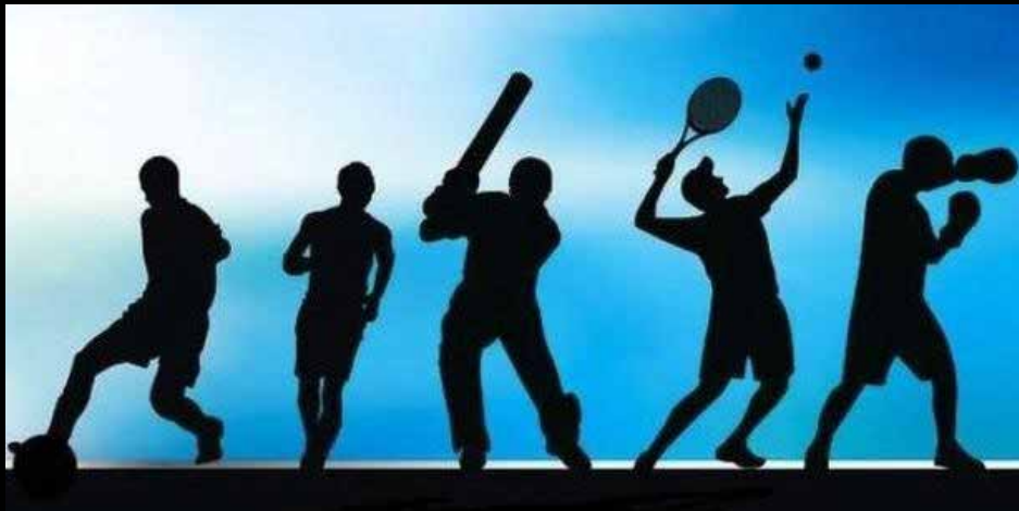
SPORTS ACADEMY BY TENVIC