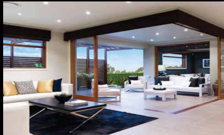
AIR CONDITIONED VILLAS