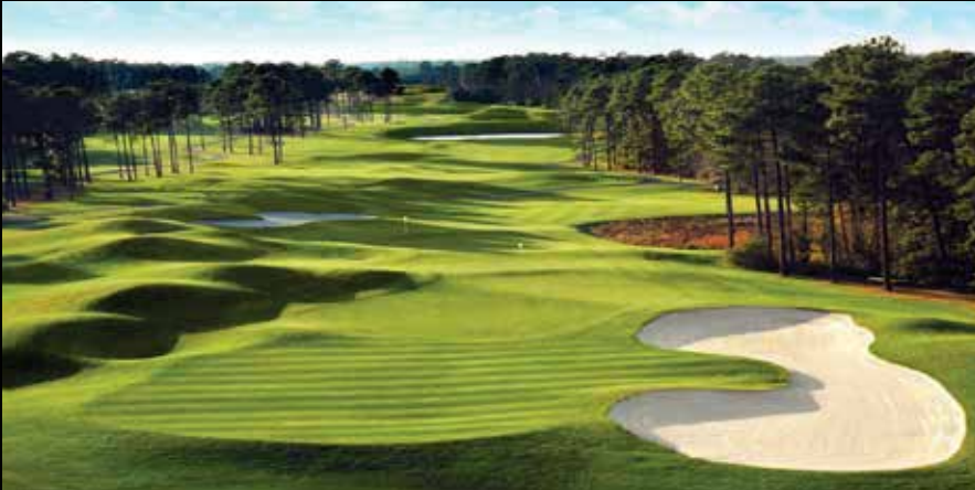
9 HOLE ORGANIC GOLF COURSE