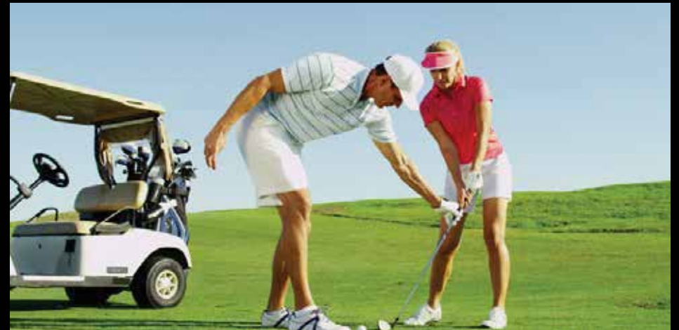
GOLF ACADEMY BY GOLFING NATION